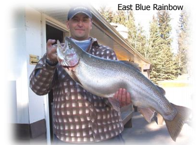
East Blue Rainbow

THANKS FOR YOUR PARTICIPATION AS YOUR INFORMATION IS ESSENTIAL TO THE MANAGEMENT OF OUR FISHERIES RESOURCES.