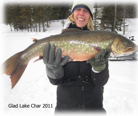
Glad Lake Char 2011

Fund of $4800 to purchase Arctic Char Eggs destined for Glad Lake. The Whiteshell Hatchery has partnered with this project and will be raising the char prior to stocking in 2016 and 2017. In the meantime SVSFE technicians will be collecting data on Glad Lake to determine a baseline, or "state of fishery" prior to stocking. Data collected will aim to collect species and forage compositions as well as population estimates. Any Northern Pike captured during the assessments will be re-located to nearby pike fisheries.