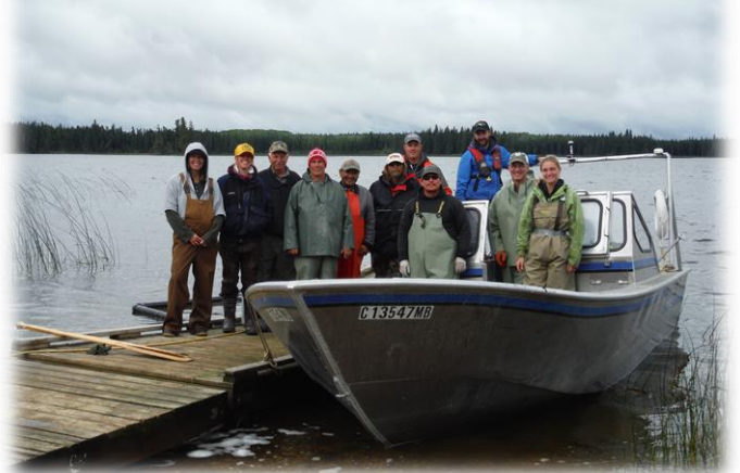
Beautiful Lake Crew 2014

THANKS FOR YOUR PARTICIPATION AS YOUR INFORMATION IS ESSENTIAL TO THE MANAGEMENT OF OUR FISHERIES RESOURCES.